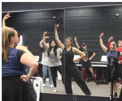
The Color Guard rehearses after school for a performance.