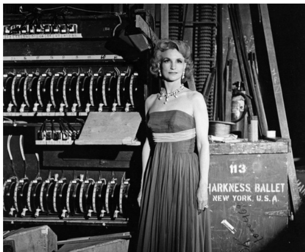
Rebekah Harkness poses for a photo in 1966.

Rebekah Harkness was born on April 17, 1915, and was an American socialite. However, what makes her so special is the reputation she left behind in a Rhode Island home. Harkness was known for wanting to do everything bad . Growing up, she was very wealthy and was recognized for creating outbursts along society events with her friends. After finishing school, Harkness went on to marry three men in her lifetime before ending up as a widower left with a Rhode Island estate. Her late husband's passing only fueled Harkness as she went on to open up a ballet workshop, steal a neighbor's cat, etc. Sadly, Rebekah Harkness would go on to die of cancer on June 17, 1962. Despite this, what makes her life story so compelling is how her legacy is told in a Taylor Swift song. The singer lays out Harkness life in a 2020 song in which she writes from Harkness's Rhode Island home, comparing the relation between Harkness' public life and hers. Taylor conveys the message by retelling Harkness' life to show her audience how a woman can be hurt by the public eye simply because they don't meet society's standards. However, both Rebekah Harkness and Taylor Swift are two women who, despite other's criticism against them, managed to accomplish so much more than anyone could have believed they could, making them truly notable.